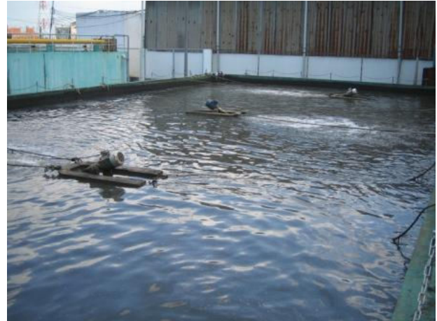
Waste Water Treatment Plant Facility at a leading F&B plant in Asia

In the aerotank, secondary treatment process, such as activated sludge is used to create a natural environment where microorganisms, such as bacteria and protozoa, turn the organic material and nutrients in waste water as their food.