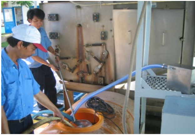
Effluent water from the aero tank is transferred into a ½ ton treatment container

Effluent water drawn from the aerotank of the waste water treatment plant was tested for parameters such as COD, TDS, TDO, O 2 Saturation, pH as well as ORP prior to any treatment. A ½ ton water storage container was used to contain the effluent water. The effluent water was then treated by a chemical free DPA system via a circulation process. The positive effects observed included: