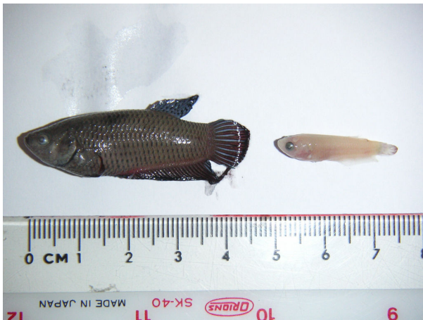
Fishes in DPA-treated (LHS) water versus fishes in non-DPA-treated water.

The fishes took a much shorter period to grow up to the same size. The fishes subjected to DPA water took 6 weeks to grow to an average size of 4.5 cm. On the other hand, the fishes in untreated water only grew to an average size of 2.5 cm. It will normally take 3 months for the fishes to grow up to a length of 4 cm and DPA system had accelerated the growth of the fishes.